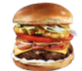
"REAL" BEEF BURGER 190g