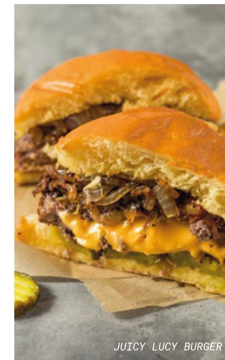
JUICY LUCY BURGER

A definitely convenient and reliable solution for a fixed result. Create within just few minutes, burgers that will surprise your audience!