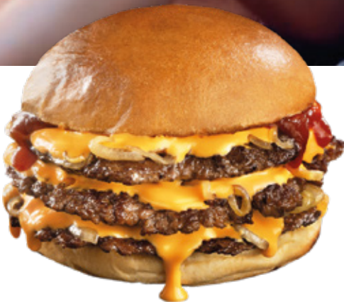
Triple Smashed Burger!

In the dynamic world of culinary exploration, burgers have emerged as a timeless canvas for innovation, reflecting both tradition and contemporary flair.