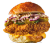
HOMESTYLE CHICKEN FILLET