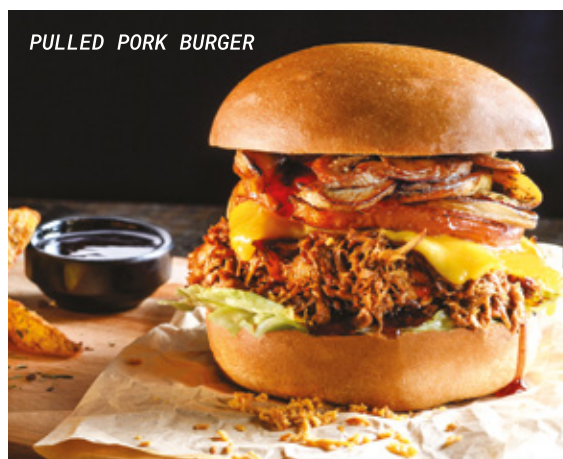
PULLED PORK BURGER